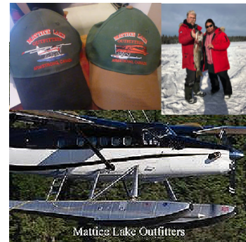
Mattice Lake Outfitters

Join or Renew your FOW Membership Today!