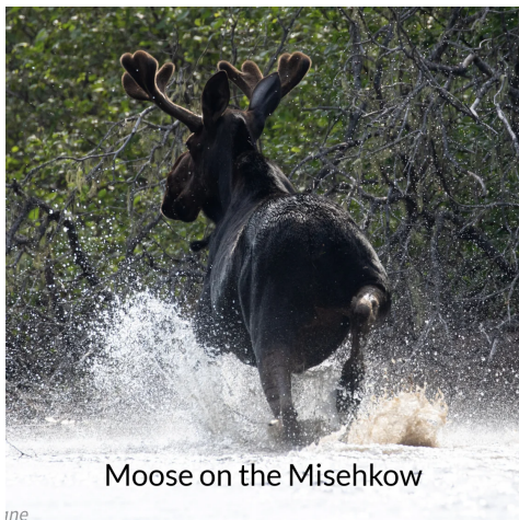
Moose on the Misehkw